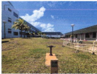
Image A - Image of Site Facing from Existing Access Road