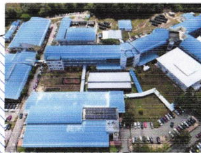
Image B - Aerial Image of Site